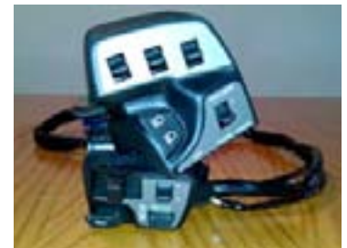
Honda Part No. 35020-MCA-000 New Left Handlebar Switch Set. Fits 2001-2003 GL1800 Goldwing. Retail price $215.92. Sale Price $50.00