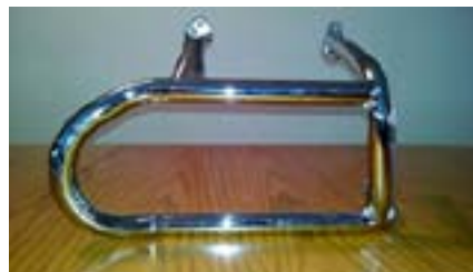
Honda Part No. 62601-MN5-000 New left hand crash bar for GL 1500 Goldwing. Fits 1988 to 1997 GL1500 Gold Wing. Retail price $374.40 Sale Price $25.00