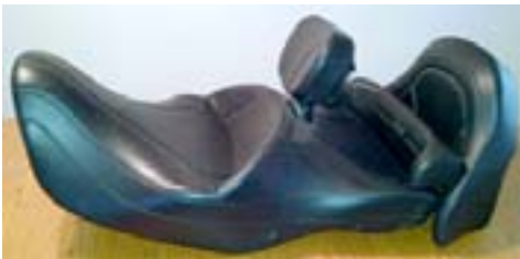
Kuryakyn Ultimate Heated Touring Saddle and Heated backrest. Fits GL1800 2006 to 2010. Retailed for over $1300 new. Only $250.00