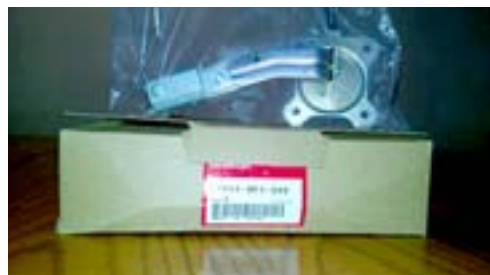
Honda Part No. 37800-MT8-008 New fuel level sending unit. Fits 1990-2000 GL1500. Retail price $51.41. Sale price $10.00