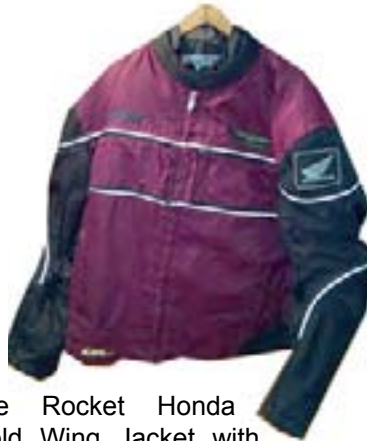
Joe Rocket Honda Gold Wing Jacket with protective liner, protective pads, and upzips to mesh. Size Extra Large. Excellent Condition. $30.00