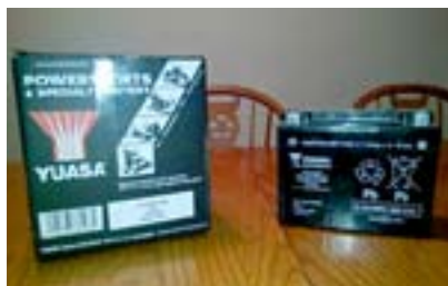
New Yuasa battery No. YTX24HL-BS Maintenance Free Battery. Fits all Goldwings from 1975 to 2000. Has been kept at full charge with a Battery Tender. Retail price as high as $144.00 Sale price $39.00