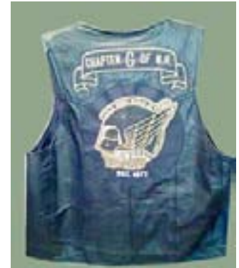
Black Leather Vest with Chapter NH-G patches already on. Size Medium. $20.00