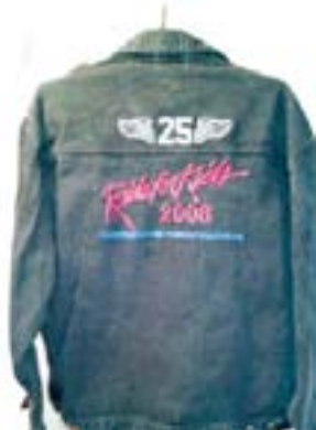
Black Denim 25th anniversary Ride for Kids Jacket. Size Large. $5.00