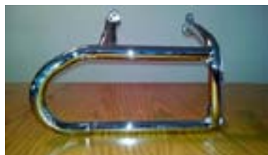
Honda Part No. 62601-MN5-000 New left hand crash bar for GL 1500 Goldwing. Fits 1988 to 1997 GL1500 Gold Wing. Retails for $374.40 Sale Price $25.00