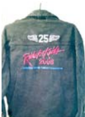
Black Denim 25th anniversary Ride for Kids Jacket. Size Large. $5.00