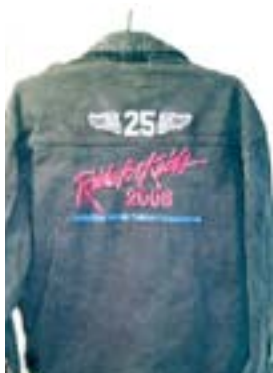
Black Denim 25th anniversary Ride for Kids Jacket. Size Large. $5.00