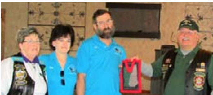
Chapter NH-E stealing the NH/VT flag at the April Gathering on 4/12